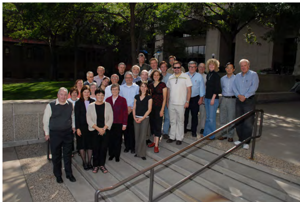
Faculty & Administrative Staff, Department of Medicinal Chemistry, Fall 2008