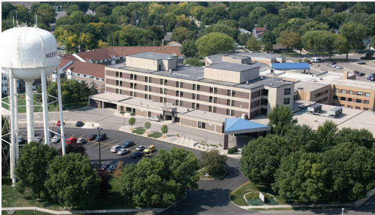
Aerial view of Avera Marshall Regional Medical Center in Marshall, Minnesota

With pharmacy services in rural health systems becoming increasingly complex, desire on the part of these systems to hire residency-trained pharmacists has grown significantly. Few regions in the state have experienced this more than southwestern Minnesota. The population distribution in the region includes a plethora of small towns with populations less than 3000 and very few “cities” with populations exceeding 10,000. As a result, there are many small rural health systems across the region – systems that are frequently seeking to expand the scope of services provided by their pharmacists.