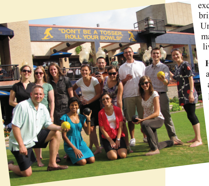
Residents lawn bowling at Brit's Pub in downtown Minneapolis