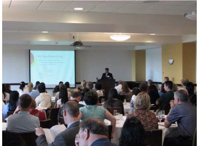
Working session at the Midwest Conference